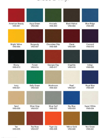
Grade 2 Vinyl