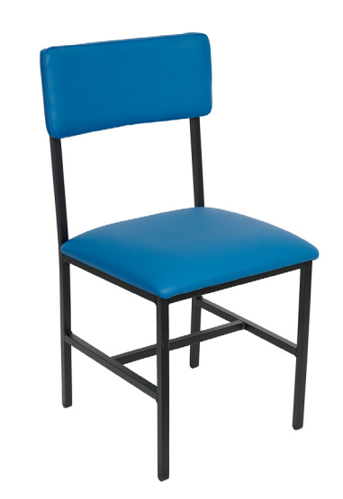
STANDARD SEAT & BACK