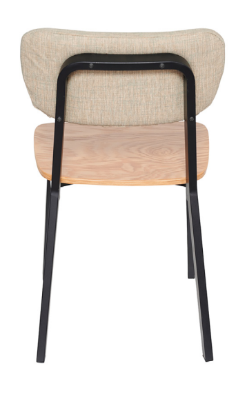
UPHOLSTERED BACK ONLY